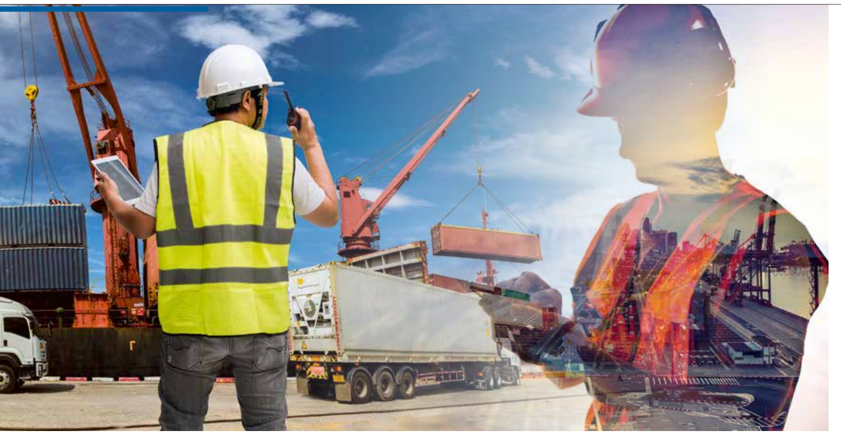
People are not only key to successful automation and digitalisation, they are also indispensable for our future.