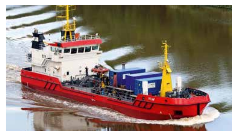
The "Vilm" is one of five oil-fighting vessels operated by the Fairplay Towage Group on behalf of the German government and coastal federal states.