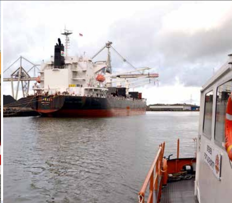
Variety guaranteed – whether it is in the industrial port, the timber port, the Neustadt port or in Bremerhaven, Bremen's ports always offer

■ ■ ■ Another focus of his work is the monitoring of ship movements, such as the allocation of berths, where particular attention must be paid to draughts. “With the ‘digital Weser’ project, we’re looking to implement the just-in-time arrivals concept, JIT for short, in both Bremen and Bremerhaven in the future, in a similar fashion to the Hamburg Vessel Coordination Center,” says Berger. The terminal availability determines the optimum operating speed for the ship up to the pilot boarding point. In addition, Berger is also currently involved in designing a new port development concept for Bremen’s ports, which will lay the foundations for future port expansion.