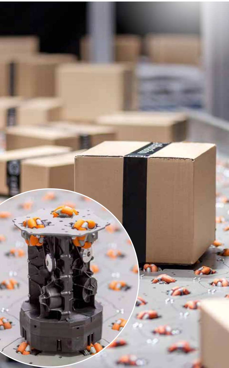
Cell-based conveyor technology enables packages to be sorted more efficiently and containers to be unloaded more quickly.

Cellumation's goal is ambitious ... at some point in the future, every package delivered across the globe will have come into contact with one of the high-tech company's cells by means of smart conveyor technology, an innovation for which the Bremen-based start-up has already won a series of awards and attracted significant investors.