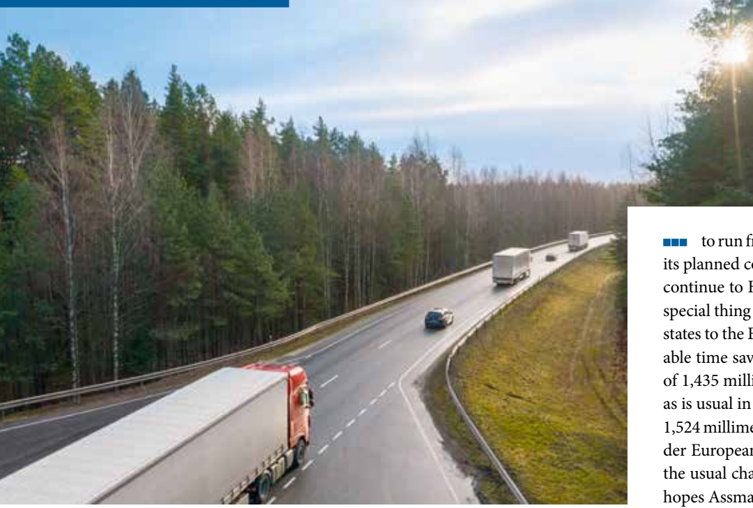
The 1,700-kilometre-long European route E 67, also known as "Via Baltica", is considered to be the most important road connection in Northern Europe.

to run from Warsaw via Kaunas and Riga to Tallinn after its planned completion in 2026. From Tallinn it should then continue to Helsinki – possibly even through a tunnel. The special thing about it: The line, which is to connect the three states to the European railway network and ensure considerable time savings, is being developed in the standard gauge of 1,435 millimetres common in Western Europe and not – as is usual in the Baltic states – in the Russian wide gauge of 1,524 millimetres. "This will be a breakthrough for cross-border European rail traffic on the north-south axis – without the usual change of locomotives and wagons at the border," hopes Assmann.