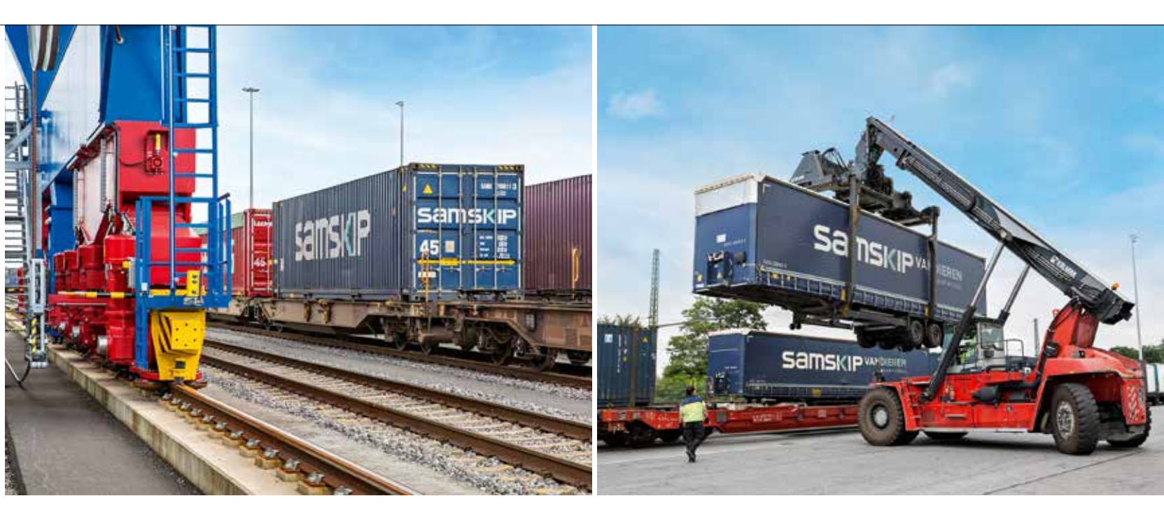
The logistics services from Samskip cover the entire range of transport modes – from short-haul and road activities to rail and inland waterway services. According to the company, it moves around 800,000 containers a year.

vice together with long-standing feeder partners and vessels carrying between 900 and 1,700 TEU. Via Riga, Klaipėda and St. Petersburg, they deliver the goods for the entire Baltic Sea economic region, which are then transported on to Moscow or Central Asia using the desired mode of transport. Samskip has its own branch offices in the destination ports and countries referred to, which then implement the corresponding transport solutions. The company also has its own fleet of trucks in the Latvian capital of Riga, which covers the Baltic region.